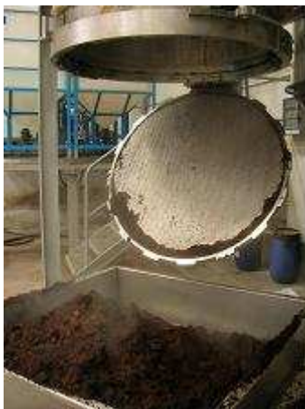
Treated seed Emptying the extractor

The treated seed is a wet solid waste. The easy biodegradability of remaining waste was proved. It is the essential characteristic for the compost use as it means that it is fermentable and so the material is feasible to be assimilated by microorganisms.